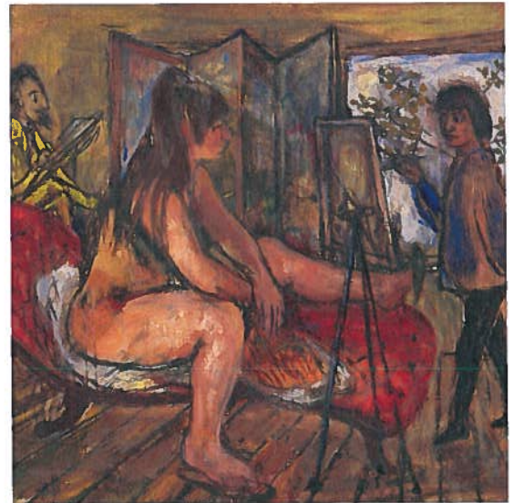
Studio with Nude Model, 1970