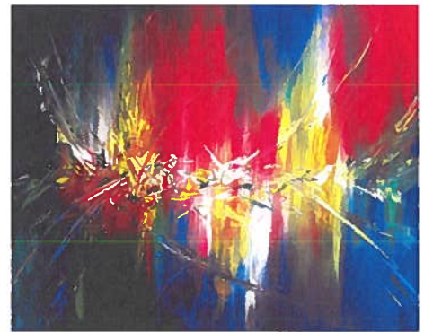
Oxygene Koestler Arts Mentoring Scholar Acrylic on Canvas, 2022

Since the scheme was launched in 2008, it has supported 230 mentees, of whom ten have been funded by the Marie-Louise von Motesiczky Charitable Trust, with another appointee imminent.