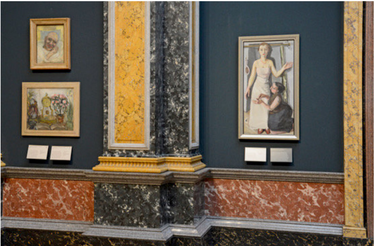
Paintings by Marie-Louise von Motesiczky in the newly reinstalled Founders' Galleries at the Fitzwilliam Museum, Cambridge