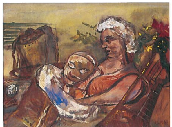
The Hour 1967