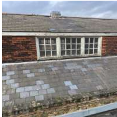
Roof works needed!

been in a poor state of repair for some time and, subject to a decision on the future of the hall itself, will still require additional work to protect them from further deterioration.