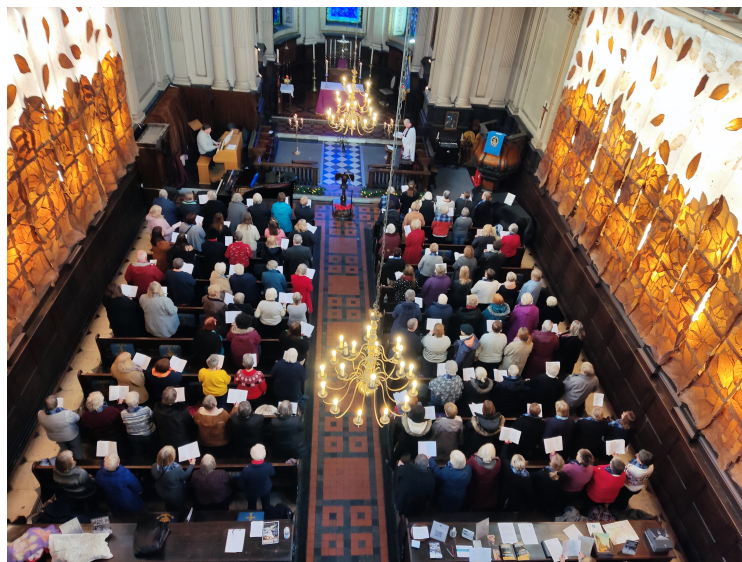
Tobacco Leaves Art Installation & WRNS Carol Service

We again hosted Carol Services for the Association of Wrens, Farrer & Co and the LSE.