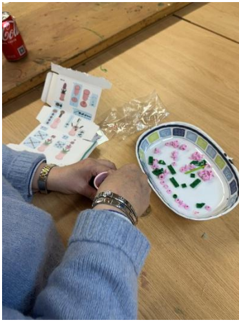
CWTSH Lego Building