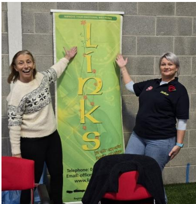
Showcasing in the barn before a home game at Parc Y Scarlets

In October 2024, Links was invited to set up a showcase at the barn in Parc Y Scarlets ahead of a home game. It was a fantastic opportunity, and we continued to showcase at every home game for the remainder of the season.