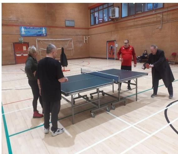
Members at Llanelli Leisure Centre

A Lego building session was held at Links as part of the CWTSH (Community Wellbeing Training and Support Hub) partnership, which hosts drop-ins every Friday. Members had the chance to purchase a box of flower-themed Lego for £1. Everyone had a great time, working together to complete the challenging pieces and enjoying the activity as a group.