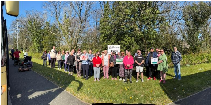
Links and CWTSH on a day out to the Royal Mint

During this reporting period, Links worked alongside the CWTSH project (Community Wellbeing Training and Support Hub) and held weekly drop-ins at Links which were facilitated by a Member Champion. A trip was also organised to the Royal Mint. 29 members attended the trip supported by staff. A great day had by all.