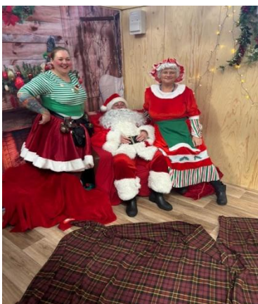
Christmas at the Goodshed

Below are some of the creations made by Links members: -In December, staff and members took part in a Christmas Fayre at the Goodshed. Staff dressed festively for the occasion, and one member volunteered to play Father Christmas in the grotto. Links also had a stall at the event to sell the items created by members.