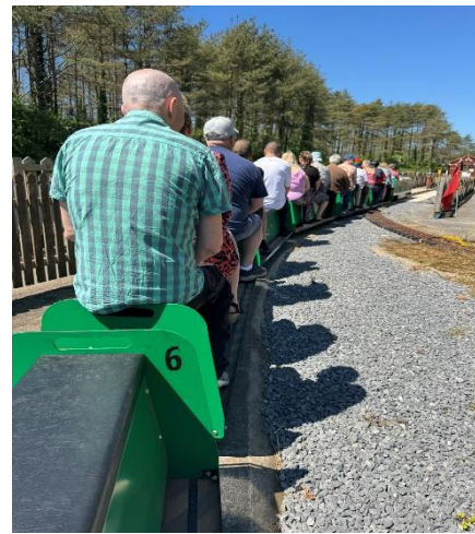
A day out at Pembrey Country Park