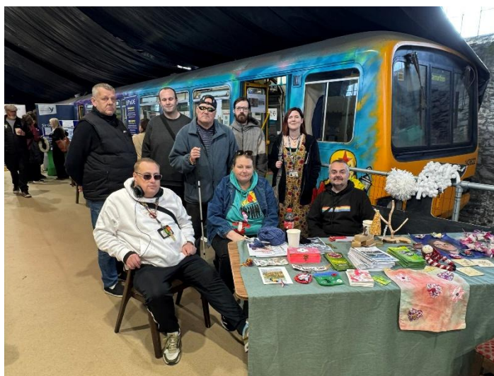
Showcasing at the Goodshed

Links took part in another event at the Goodshed, providing a great opportunity to showcase and sell members' work. Members and volunteers enjoyed being involved on the day, helping to set up the stall and engaging with the public.