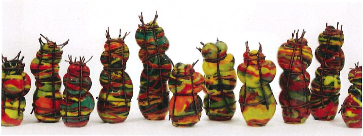
Vessels By Chris Day on Display at Two Temple Place, London

We had part of our historic glass collection on display at The Glass Heart Exhibition at Two Temple Place, London from 27 January to 21 April 2024 which included work by local glassmakers and Trustees, Chris Day and Elliot Walker.