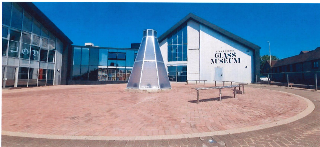
Stourbridge Glass Museum 2024