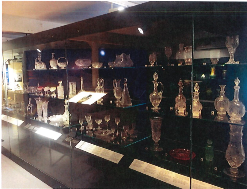
Historic Glass Ground Floor Gallery

This year marks the 2nd Anniversary of the opening of Stourbridge Glass Museum. After many delays and challenges, including Covid, the brand-new Stourbridge Glass Museum opened to the public for the first time on Saturday 9 April 2022 and was formally opened by HRH The Duke of Gloucester on 19 April 2023.