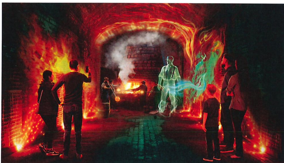
Concept for the Tunnels by Simworx

Tours of the tunnels beneath the museum are undertaken by a team of volunteers and these are extremely popular and sell out quickly. We have been bequeathed 600 items of uranium glass and some of these are on display in the museum and some in the tunnels as they "glow in the dark". A concept has been drawn up by Simworx in Kingswinford for interpretation in the tunnels and we are working on grant applications for the funding for this.