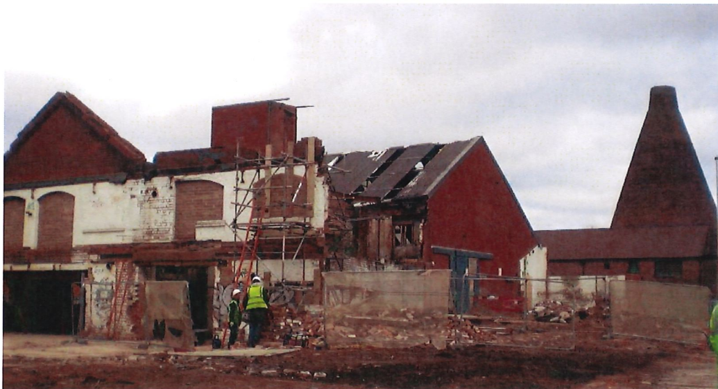
Derelict Site 2015