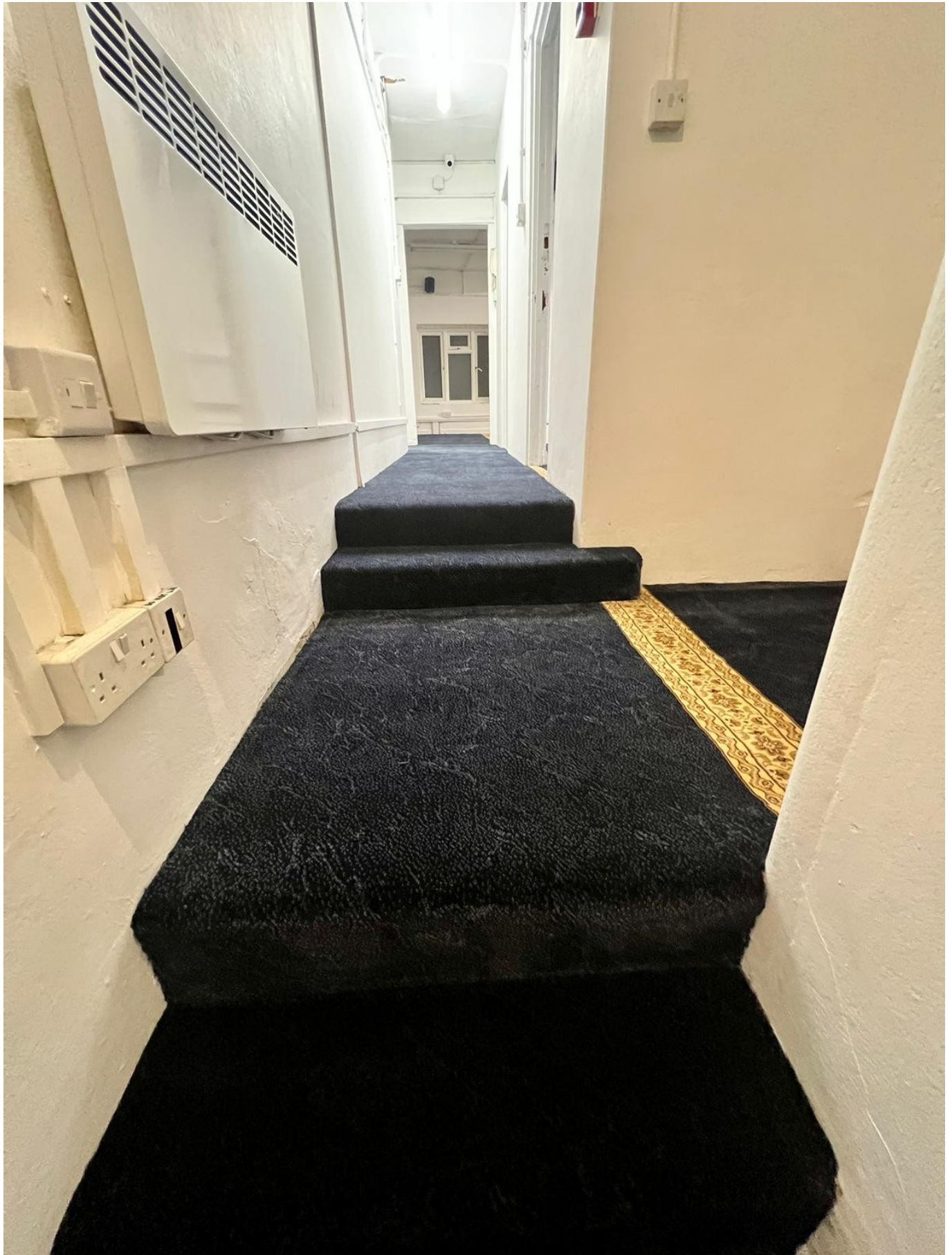
Selection of leaflets and booklets distributed free of charge in collaboration with our brothers from City Centre Dawah (CCD) Birmingham.