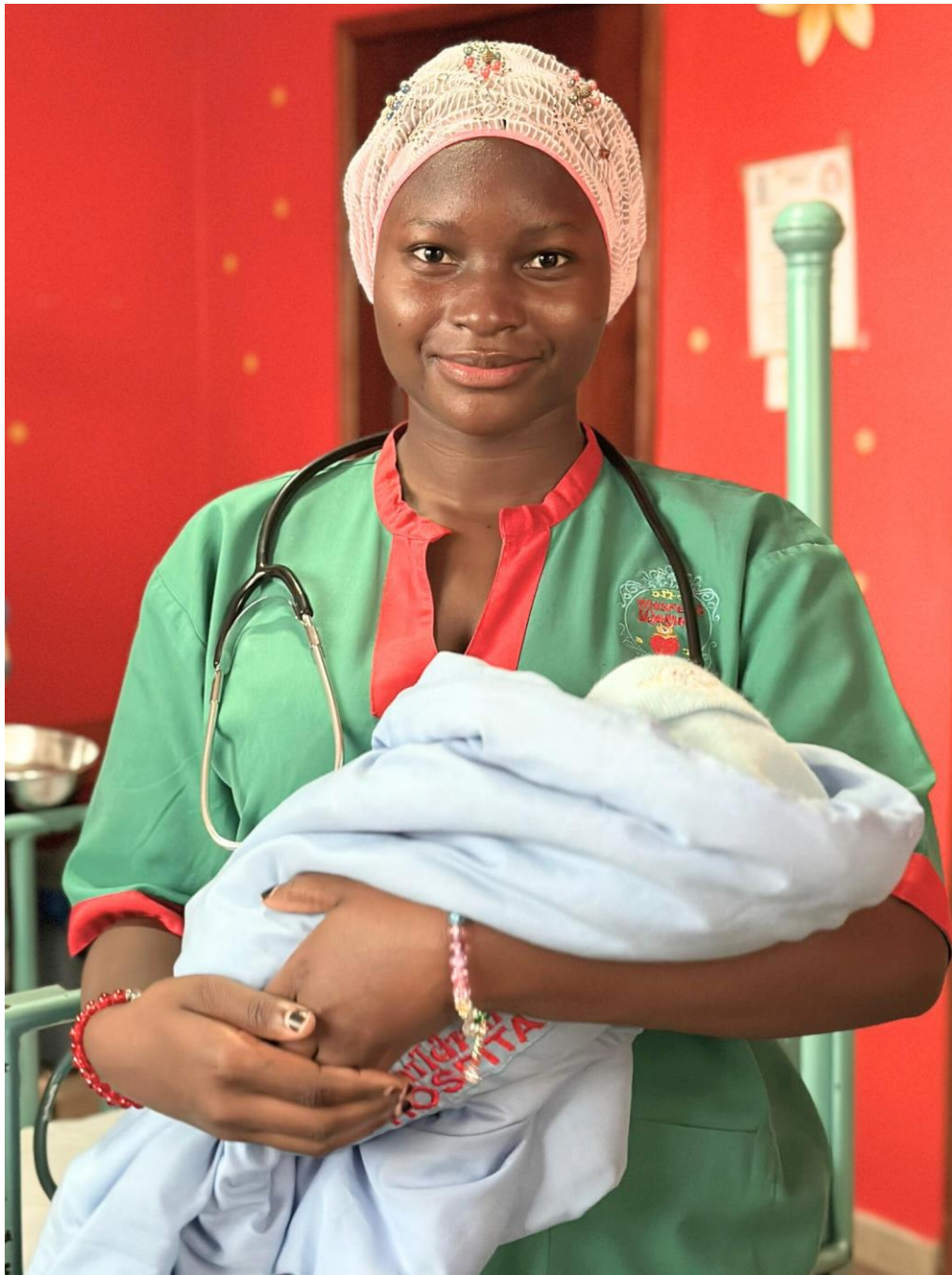
Nurse in the Emergency Ward