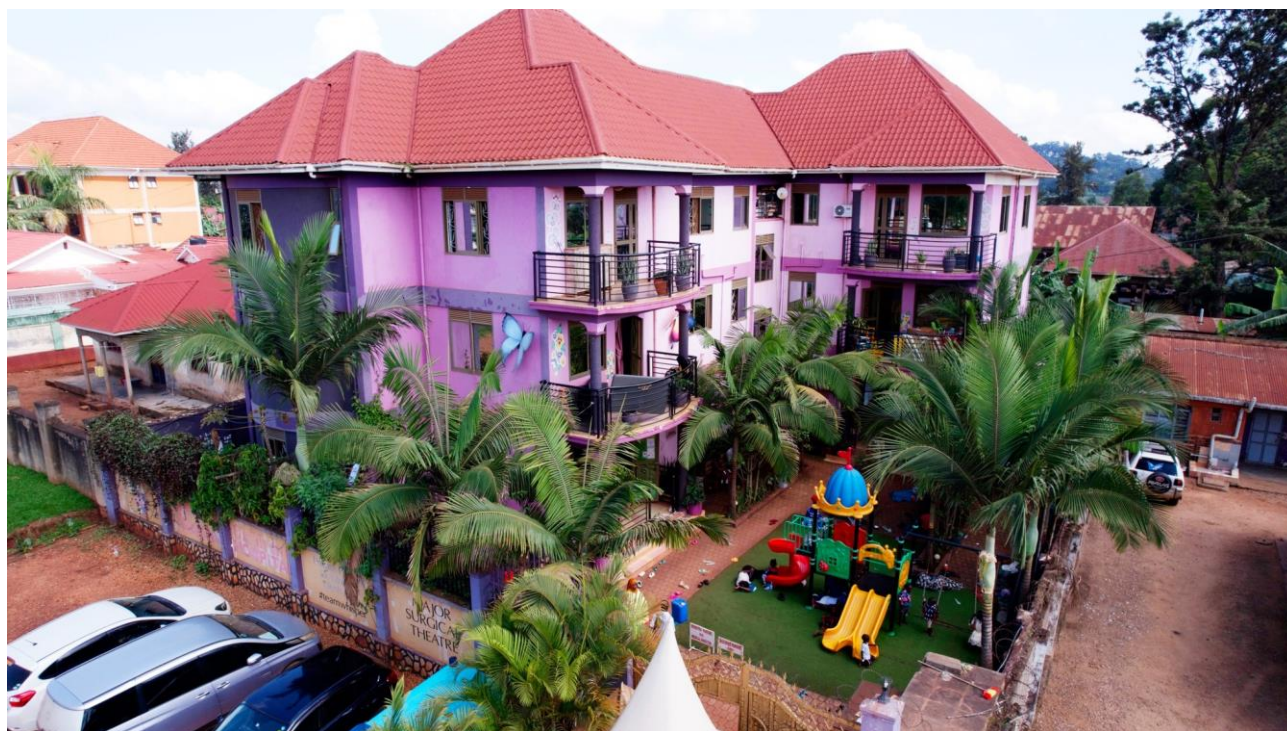
Whisper's hospital from the air