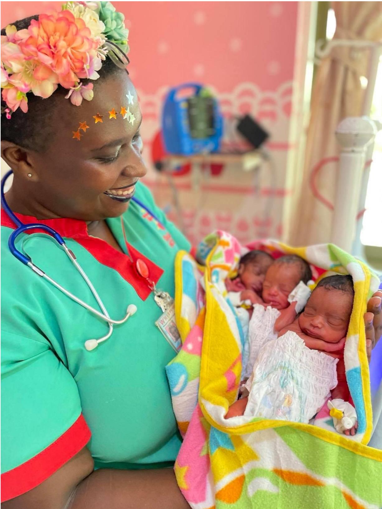
Premature triplets, cared for in Whisper's Neonatal Intensive Care Unit (NICU)