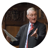
Hilary Benn MP Patron

It is with heartfelt thanks, but also sadness, that I write these words for the Caring Together Annual Report for the last time.