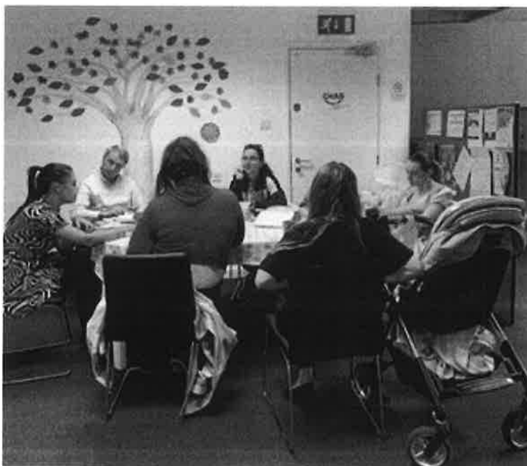
Pictured: Young people taking part in the scrutiny group meeting

We also supported young people to take part in the Vital Signs research for South Yorkshire's Community Foundation, empowering them to have their say about what matters to them in their local community.