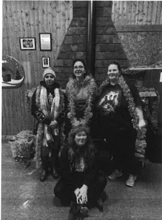
Pictured: Young people took part in volunteering activities at Christmas.