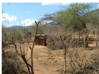
Leah's home in Wamba