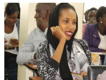
Leah at University

Overall we have supported 58 girls and young women with 33 ongoing and 2 waiting to get their exam results before continuing with further education.