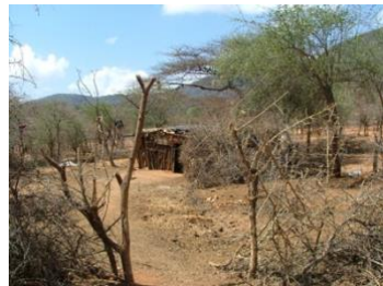
Leah's home in Wamba