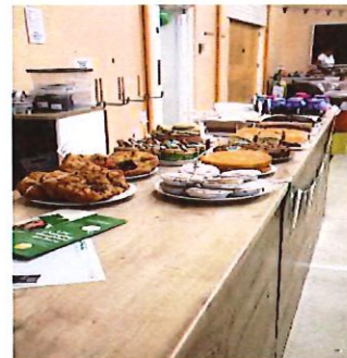
Delicious Bakes for the Macmillan Coffee Morning

Along with Roll Model CIC we were pleased to send a donation to St. Helens Council Christmas Appeal to support vulnerable and disadvantaged children in the Borough.