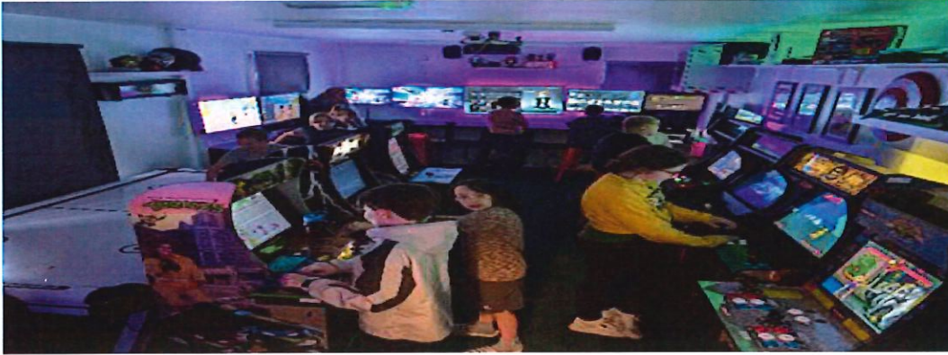
A great session at the Arcade Club

A new group was set up in partnership with Chain Lane – Friendship Bench Fundraising Group. This comprised some local dog walkers and two Trustees from Chain Lane. A need for another bench on the park area adjacent to the Centre had been identified. Fundraising activities for this bench with the lovely name 'Friendship Bench' were held – a 'Big Brew' Coffee morning, a table top sale and quiz night, all with great community support. In addition to a very generous donation from our local NISA supermarket's charitable arm – Make A Difference Locally, funding was secured and the bench and base ordered from St. Helens Council who own the land. In addition in September the group held a Macmillan Coffee Morning in support of that charity. The Centre is the fundholder for all monies raised. Catherine, Centre Manager, was successful in getting a grant from the Skelton Charity to support Centre work with older people.