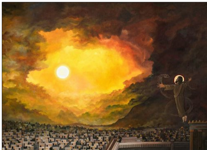
Jeremy Thomas' painting of the Temptation of Christ

The church's mission and outreach stretched beyond the four walls of the churches or even the town, with our online