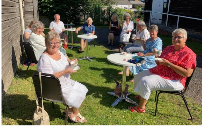
Coffee after the service resumed at Christchurch in June

As in 2020, many of the usual annual events were not held in 2021 because of Covid. However, the following did take place: