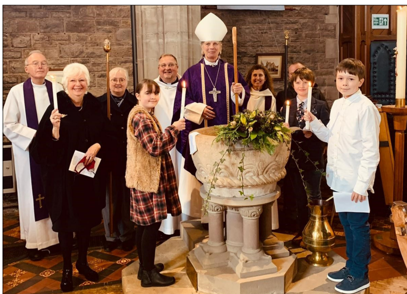
The Confirmation service on November 28

In addition to our regular services, we continued, when possible, to enable our community to celebrate and thank God in the milestones of the journey through life. As in 2020, and as expected, these life event services were much reduced, with five baptisms, four weddings and 15 funerals, although the clergy conducted many more funerals at local crematoria.