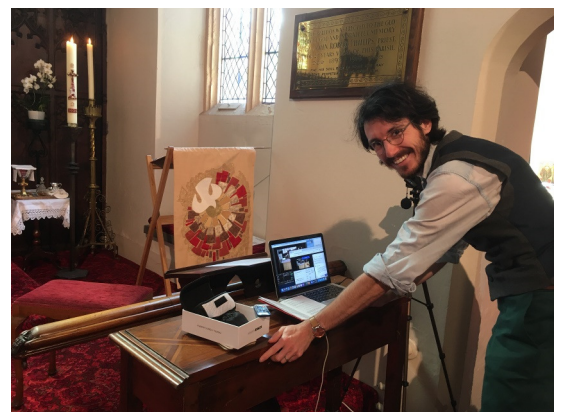
Streaming an online service

Ecumenically, the parish participated fully in the Abergavenny Council of Churches, although meetings were via Zoom and this year's Walking Nativity was cancelled.