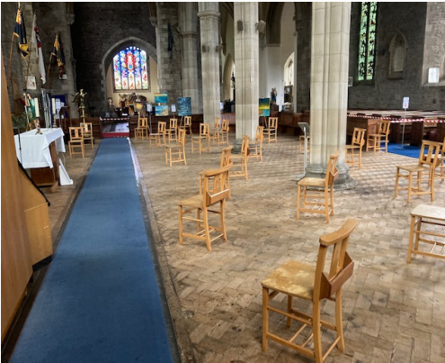
A new look for St Mary's as social distancing came into effect as the church re-opened in September

Acts of worship, including some of the Benedictine Offices, were celebrated on almost every day of the year until mid-March, and in-person pastoral care continued throughout the first 12 weeks of the year, in particular, the visiting of, and on occasions taking Communion to, parishioners who through sickness or age were unable to come to church. After March, this pastoral care took place online and by telephone and it was not possible to take Communion out to the housebound.