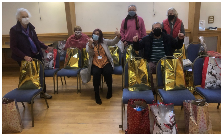
Assembling gifts for teenagers and young adults—one of the church's outreach projects