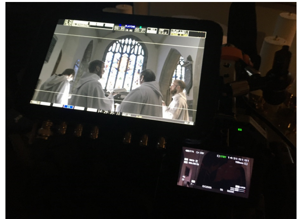
Being filmed for the Church in Wales Centenary video

The Charity received no other grants for services delivered, from central or local government during the year. However, Welsh Assembly and Local Authority groups, along with the NHS (including the Wales Blood Service), are users of the meeting and event accommodation provided in the Priory Centre and Tithe Barn.