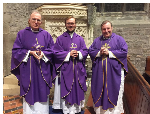
Our priests at the start of the year