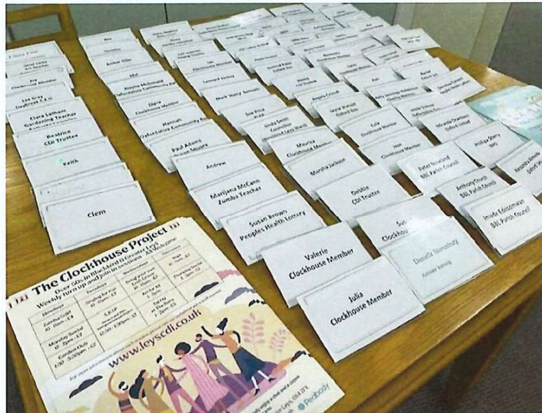
Name badges at the ready, a sample of the invitees list for the 2024 Leys CDI Garden party.

Following the success of 2023's garden party, which was primarily organised as a way of a small thank you to CDI's supporters. The day was, again, aimed at bringing various community groups and partners together, whilst also showcasing the fine work of the Seniors gardening team.