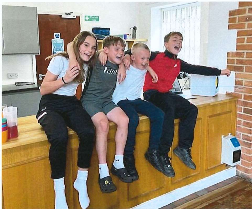
The Karaoke Crew!