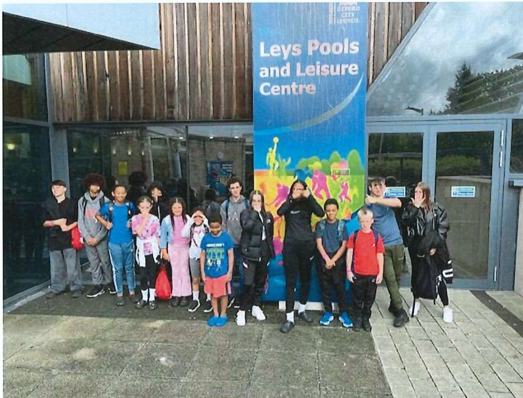
First ones dried, pose for a picture outside the fantastic Leys pool.