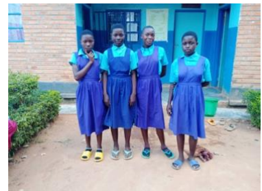
Left: Donated resources at Chisala; Right: Teachers meeting for end of the term function & students posing