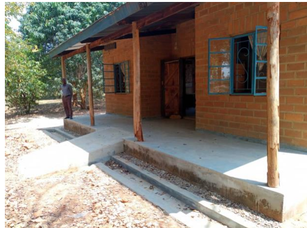
Left: Trustee Tanya in meeting with teachers at Chisala; Right: maintenance on library completed