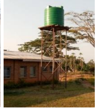
Left to right: Sports centre conversion; new water tank at the health clinic