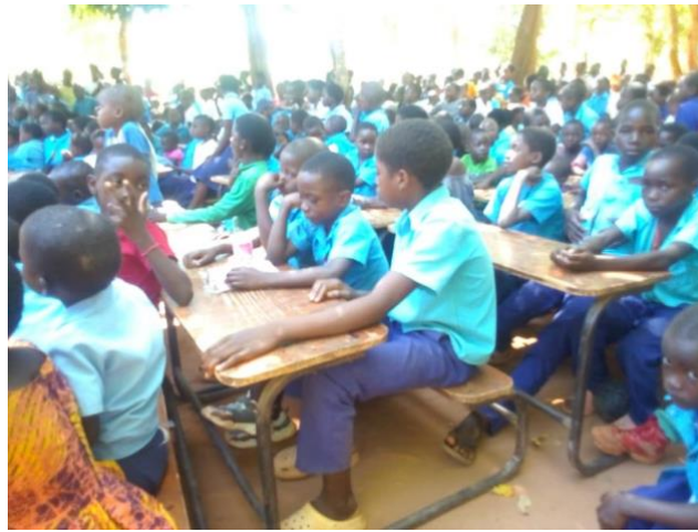
Left: Memory graduating; right: Children at the end of year function

At Mkocho school we continued to build up the school infrastructure for teachers and classrooms and;