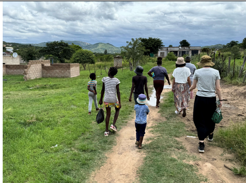
Good fun in any culture