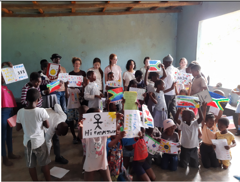
Songs and prayers of thanks before food