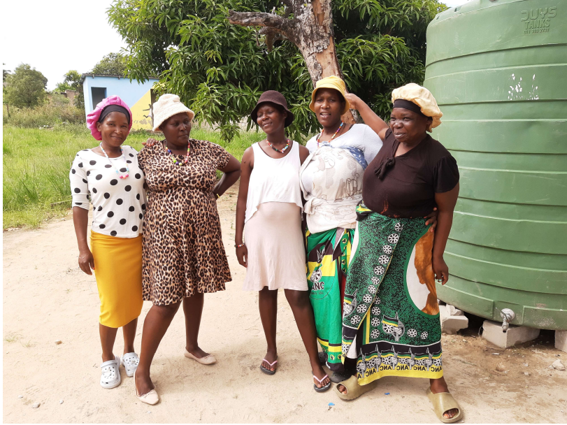
Walking to a home-based care visit