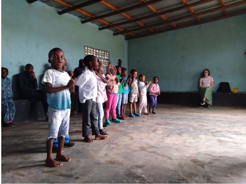
Incredible Hands at Work care volunteers at the Care Point in Mafambisa