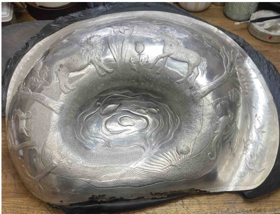
The dimensions are 46x32x7cms