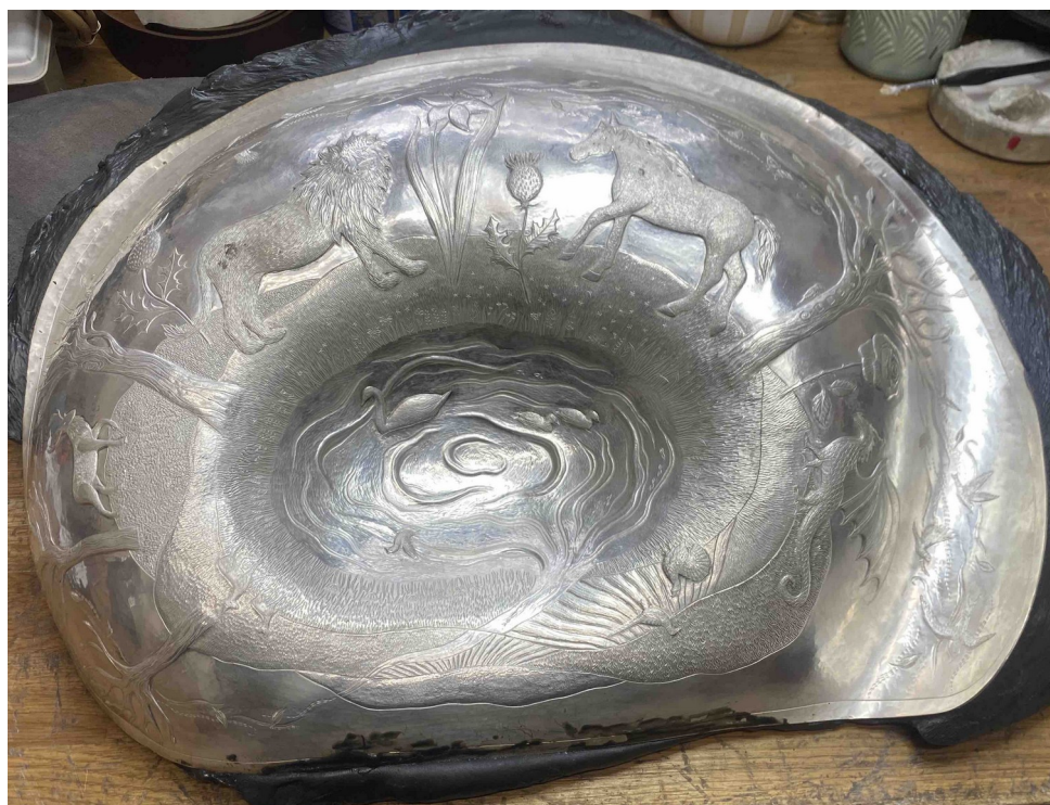
The dimensions are 46x32x7cms