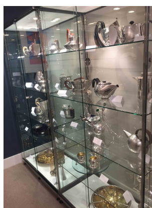
A small part of the Collection exhibited at Sworders in Cecil Court, Covent Garden, London in October 2021