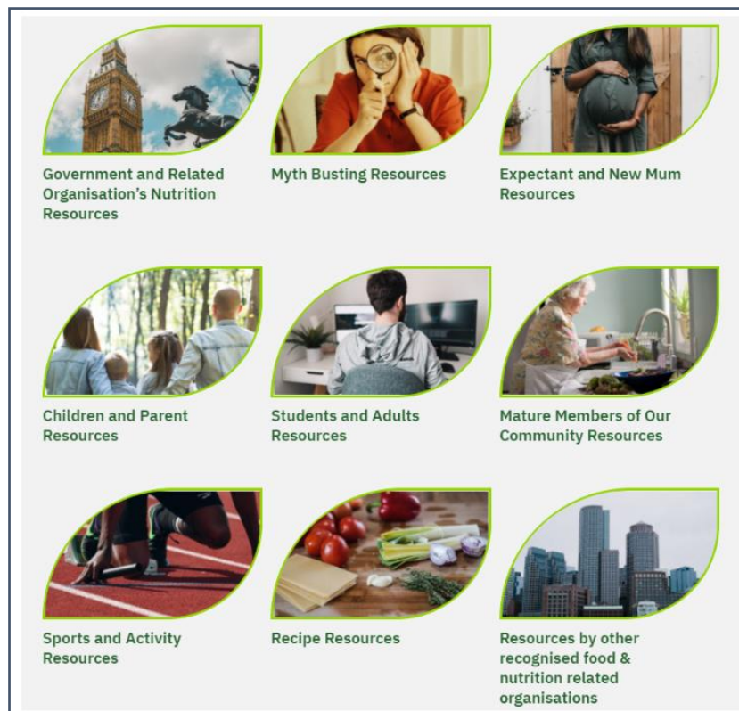
Fig 3. Nutrition Resource Hub Homepage