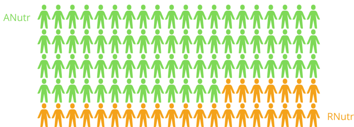
Fig 2. Registrants by registration category (each figure represents approximately 33 registrants)