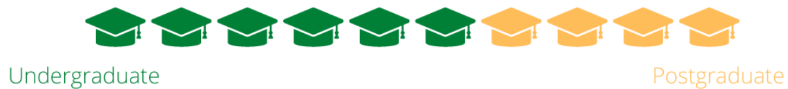
Fig 4. Split of degree programmes by level (each hat represents approximately 10%)