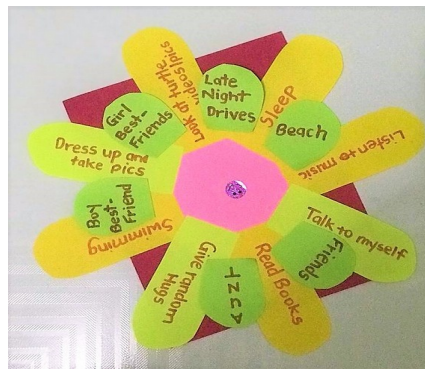
Two examples of the 'flower exercise' which collated data on support networks from youth researchers in Guyana.