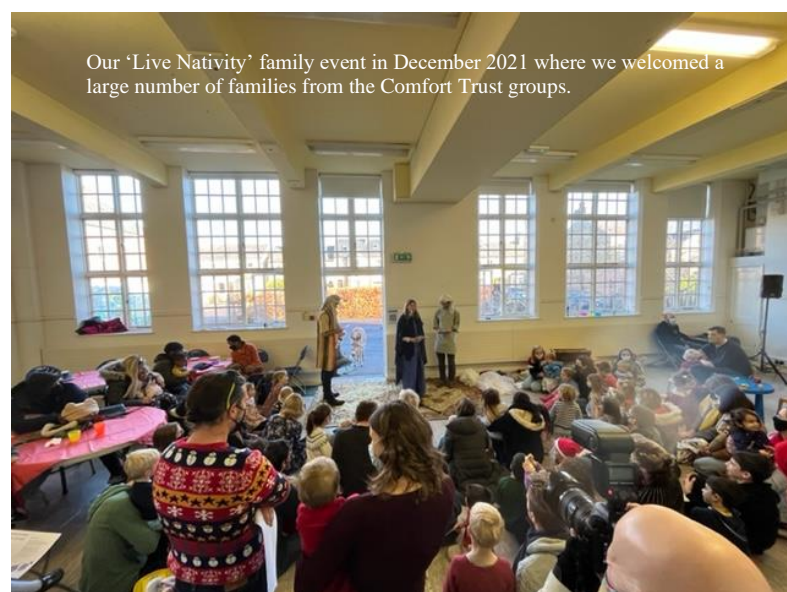
Our 'Live Nativity' family event in December 2021 where we welcomed a large number of families from the Comfort Trust groups.

The Comfort Trust is a charity associated with MRC and has for many years supported local families with its groups for parents and carers of children aged 0 – 4. The reopening of our building has allowed Sunflowers and First Saturday groups to resume their activities with the immediate and most encouraging return of considerable numbers of local families. Our thanks go to our leaders and volunteers who make help to make this important outreach flourish, generating much goodwill and reflecting the love of Christ for our community.