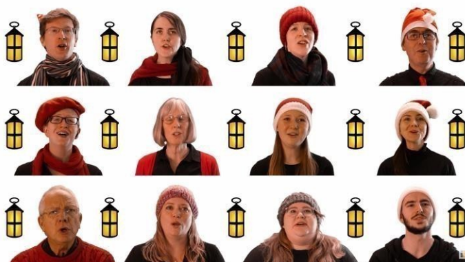
Our virtual carol service, including individually-recorded choirists for Covid security

Initially our usual in-person services, meetings and activities were severely curtailed. We began to get to grips with Zoom technology, and services on YouTube. It was sad that, having just moved services into the Old Schoolhouse, and having begun to develop our use of the building as our church "home", for considerable periods the building was largely unused. One unforeseen advantage, however, of moving onto the "screen" was that we were able to reach and engage with some people at a distance, or who were on the "fringe". The trustees hope that some of these at least can be drawn into church life when the pandemic recedes, possibly by keeping some element of communication on screen. Towards the end of the year widespread vaccination began, and hopes were raised that the easing of restrictions would follow.