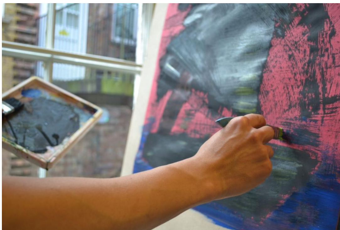
A Young Person Painting during a socially distanced Arts Session

different combinations, in addition to meeting as a group. These meetings provided an essential space for making decisions that were often urgent when young people were feeling isolated and distressed, and often cold or hungry and needed practical support quickly as they were without data for their phones or money for basics such as food and payment of bills. These regular and frequent meetings were not only about emergency situations but also gave us all opportunities to talk together in a more reflective way and to begin strategic plans for the coming five years and for the future of Baobab. While all staff continued to have access to individual and small group supervision online, for many, working online was initially difficult. We all adapted to this form of communication without ever thinking, at any time, that this might replace face-to-face work. Two of our staff developed Covid and still have been unable to return to face to face work and two were clear that they did not want to return to face to face work with young people in these challenging times. This was a loss for us.