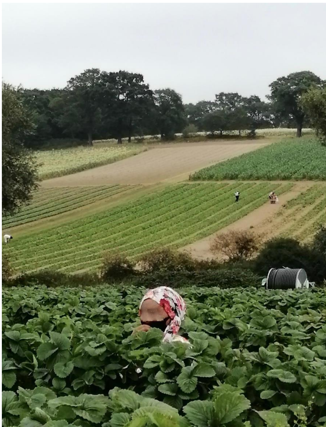
A young person on Baobab's summer outing to a fruit farm

As can be seen from our monitoring and evaluation work it is clear that we work with a population of young people who are both unusually vulnerable and unusually resilient. It is essential in the interests of their human rights, their mental health and developmental needs and in terms of the policy and practice changes necessary to ensure justice for them that we share our expertise with others. This