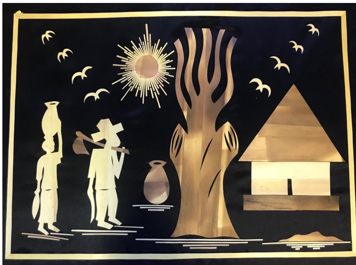
'The Baobab Tree' – a gift from one of the young people after his visit to Mali on a study placement

Over the years we have slowly built relationships with some of the Home Office Directors who we have previously invited to Baobab to talk with our staff and young people. This has developed into sustained communication and meetings where we can understand what changes the Home Office officials think are needed in the asylum system and where we can raise our issues and criticisms of the system. Our meetings have resulted recently in our being able to hold substantive interviews with the Home Office decision makers online. In these very important interviews the young person can be at Baobab, where they feel comfortable, and with their clinician and legal representative in the room to supporting them. We have also been able to directly raise specific cases where young people at