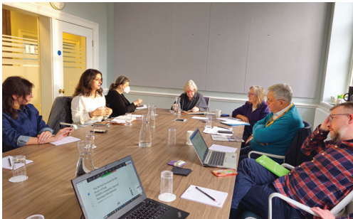
The Qantara Cultural Foundation Team meeting with the BISI

The Meditor Trust funded a BISI Trustee Away Day in November 2024 at the Centre for Islamic Studies in Oxford. Trustees of the Institute gathered to discuss the current strategic plan for the Institute and to plan for the future.