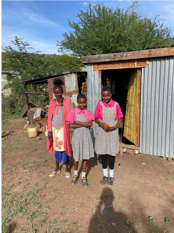
Two Osiligi primary school pupils in front of their home