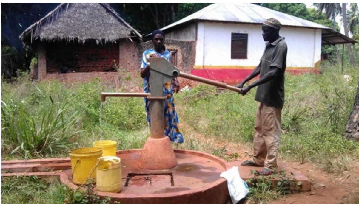
A pump repaired and a community with clean water again