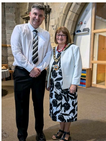
The Mayor attends the Acorn AP Graduation Ceremony.