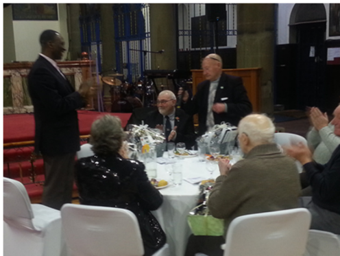
Veterans' Annual Christmas Dinner @ MICC

The financial statements comply with the Charities Act 2011, the Memorandum and Articles of Association, and Accounting and Reporting by Charities: Statement of Recommended Practice applicable to charities preparing their accounts in accordance with the Financial Reporting Standard applicable in the UK and Republic of Ireland (FRS 102) (effective 1 January 2019)