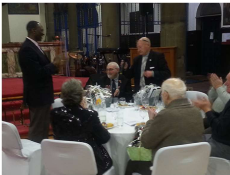
Veterans' Annual Christmas Dinner @ MICC

The financial statements comply with the Charities Act 2011, the Memorandum and Articles of Association, and Accounting and Reporting by Charities: Statement of Recommended Practice applicable to charities preparing their accounts in accordance with the Financial Reporting Standard applicable in the UK and Republic of Ireland (FRS 102) (effective 1 January 2015)