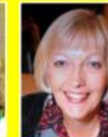
Gaynor Day Publicity