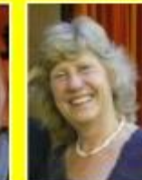
Susie Brooks Baptism Bookings