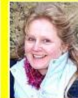
Nan Dowell Sunday & Youth Club