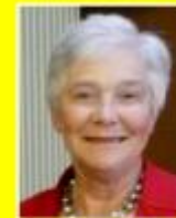
Anne Buet Church Flowers