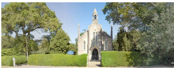
Church of St Paul Ringwood Road, Bisterne Hampshire, BH24 3BN