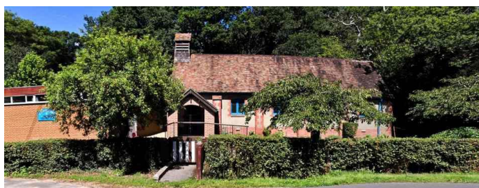
Church of St John the Baptist Linford Road, Ringwood Hampshire, BH24 1TY