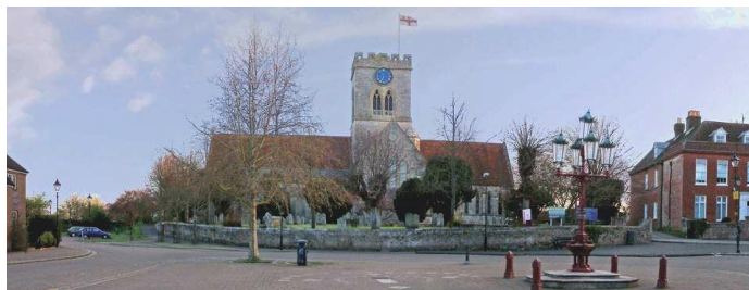
The Church of St Peter and St Paul Market Place, Ringwood Hampshire, BH24 1AW