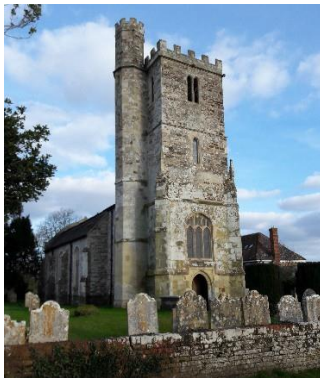
Church of All Saints Harbridge, Ringwood Hampshire, BH24 3PS