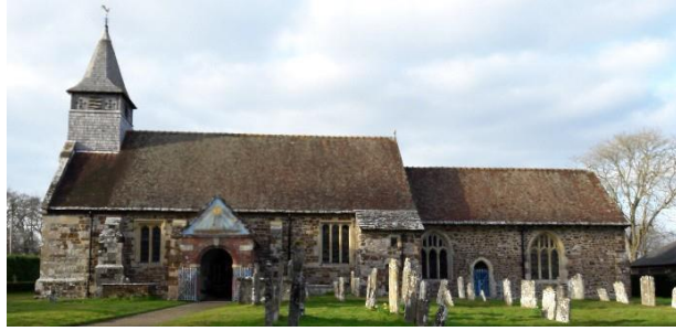
Church of St Mary and All Saints Ellingham, Hampshire, BH24 3PJ