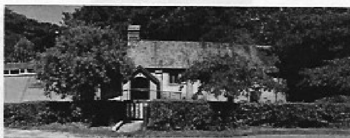
Church of St John the Baptist Linford Road Ringwood Hampshire BH24 1TY