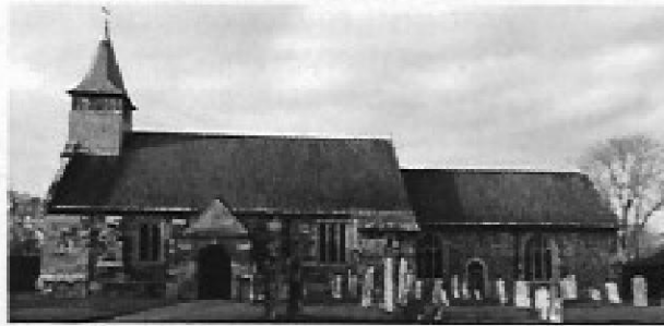
Church of St Mary and All Saints Ellingham, Hampshire, BH24 3PJ