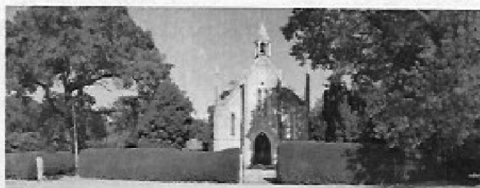
Church of St Paul Ringwood Road Bisterne Hampshire BH24 3BN