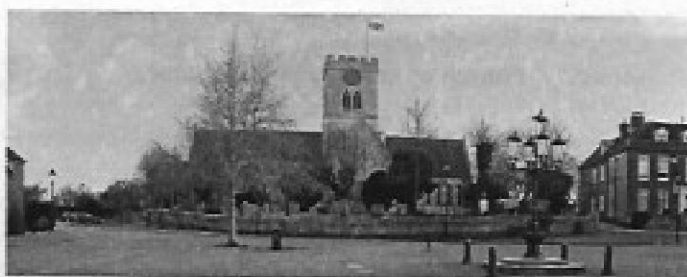
The Church of St Peter and St Paul Market Place Ringwood Hampshire BH24 1AW