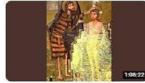
Second Sunday in Advent 28 views • Streamed 4 months ago