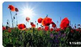
Remembrance Sunday 26 views • Streamed 5 months ago