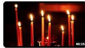
Carols by Candlelight 18 views • Streamed 4 months ago