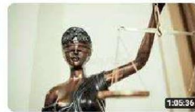
Last Sunday after Trinity

For weddings and other life events, people appreciate having the ability not only to have a recording to keep of their event, but also to share it with others who are not able to attend. We extended the scope of the AV recently, with a recording of the Come & Sign event by Whitehall Choir, as well as an excellent Lent talk.