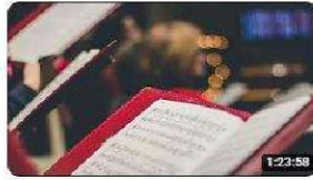
Traditional Service of Lessons & Carols 44 views • Streamed 4 months ago