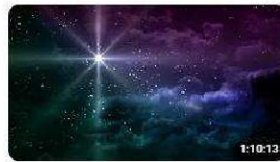
Midnight Mass 30 views • Streamed 3 months ago