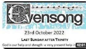
Evensong on Last Sunday after Trinity