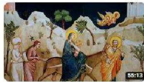
First Sunday after Christmas 16 views • Streamed 3 months ago