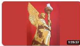
Christmas Day Festival Eucharist 35 views • Streamed 3 months ago