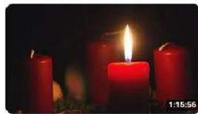
Advent Sunday 70 views • Streamed 4 months ago