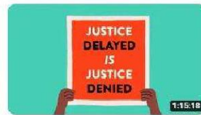
Third Sunday before Advent 99 views • Streamed 5 months ago