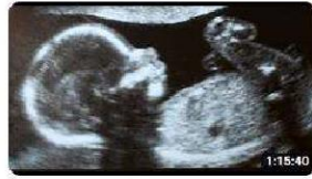
Fourth Sunday in Advent 6 views • Streamed 4 months ago