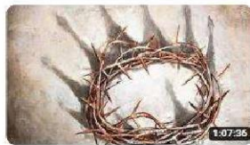
Feast of Christ the King 92 views • Streamed 5 months ago