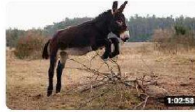
Third Sunday in Advent 12 views • Streamed 4 months ago