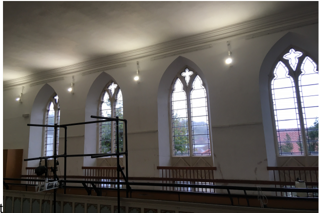
After the completion of the project