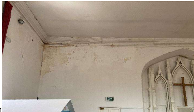
Example of the damage to the internal plaster

During this financial year, we have undertaken a major re-plastering project in the main hall. After the roof and gutter were repaired last year, we were now in a place to hack off the water-damaged plaster in the hall and replace with lime based plaster and replace the damaged covings.