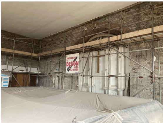
Hall walls after initial hacking off of old plaster