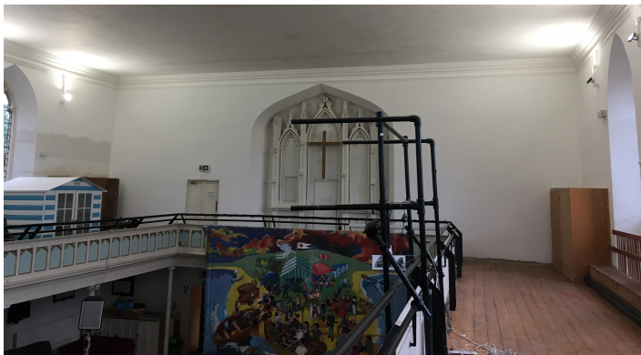
Main north wall after completion

The project was funded with residual funds in our restricted building maintenance fund and also a grant provided by the Enover Community Trust