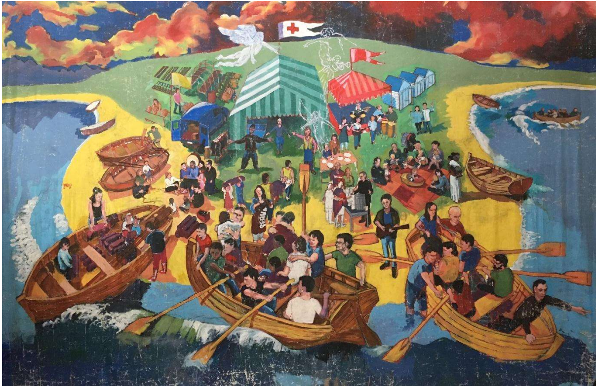
Beach & Boat Vision drape, showing how Hope operates as a church. Members gather on the beach to worship and pray together and commission the boats which then go out 'on mission'.

Hope's mid-week ministries are listed below under the other dreams to which they relate. In line with the 'Beach and Boat Vision' these ministries are described as 'boats', communities of Hope members who are together on a missional purpose as shown in the drape that hangs in the hall in Hope Chapel.