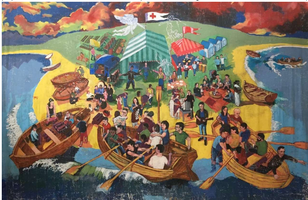
Beach & Boat Vision drape, showing how Hope operates as a church. Members gather on the beach to worship and pray together and commission the boats which then go out 'on mission'.

Hope's mid-week ministries are listed below under the other dreams to which they relate. In line with the 'Beach and Boat Vision' these ministries are described as 'boats', communities of Hope members who are together on a missional purpose as shown in the drape that hangs in the hall in Hope Chapel.