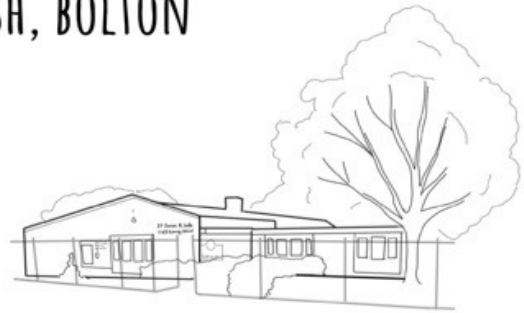
S S SIMON & JUDE