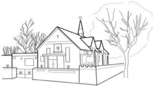
ST GEORGE WITH ST JAMES