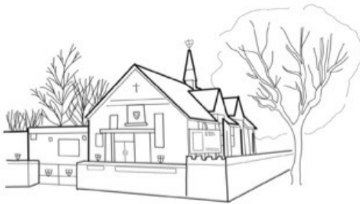
ST GEORGE WITH ST JAMES