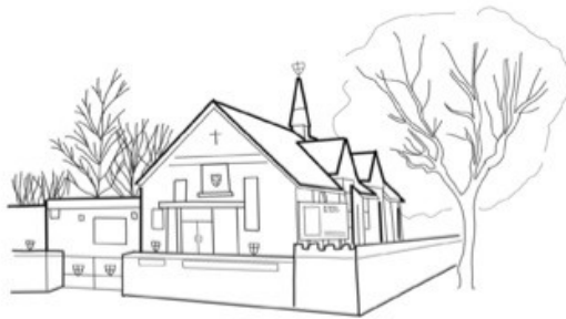
ST GEORGE WITH ST JAMES