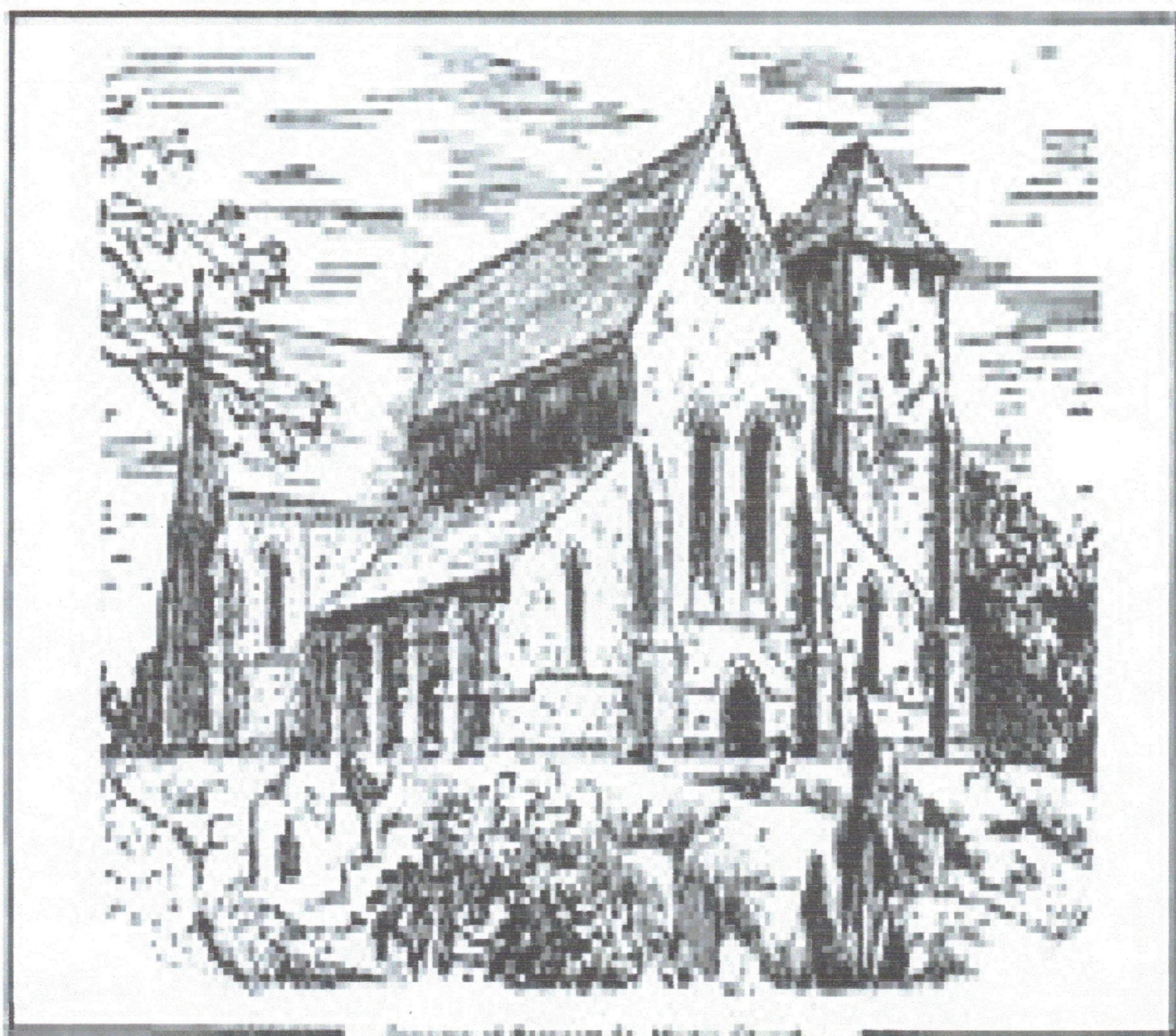
View of Pensnett St. Mark's Church