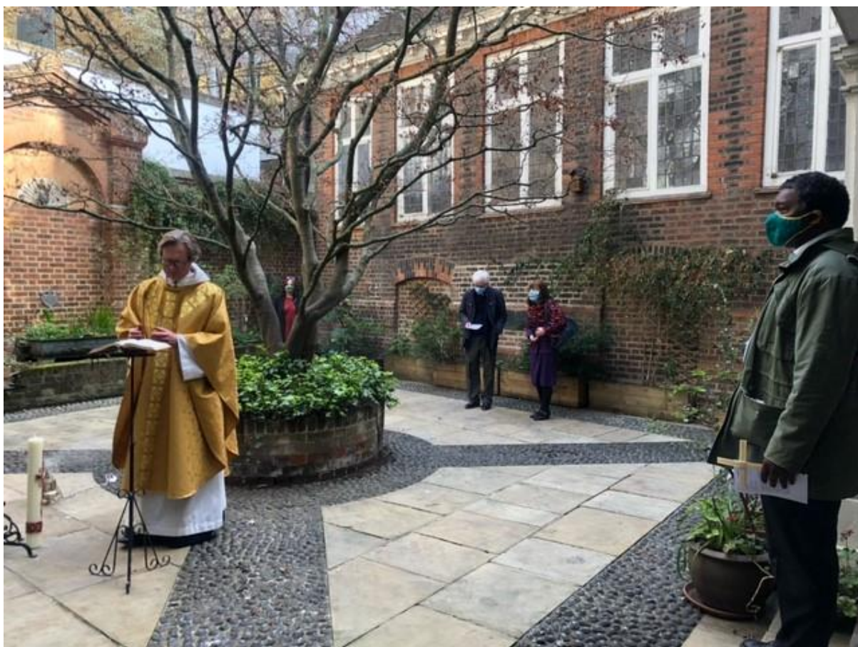
Socially distanced Easter Service in the Courtyard