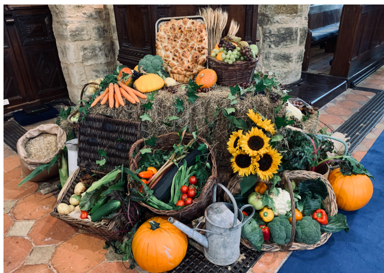
A cracking Harvest display. One of the many stunning arrangements that our flower team at St Peter & St Paul create week-on-week, to the glory of God's creation.

In particular at Easter, it was a pure delight to have the church full of flowers. Thank you to the flower ladies for providing the various arrangements and a big thank you to those who enabled the process by contributing to the cost of the lilies. Further, Longacres of Bagshot did a Stirling job in ensuring the Easter Lilies (50) were in optimum condition.