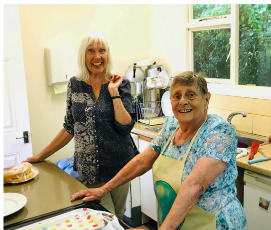
The ladies from Kindred Spirits run the 'pay what you feel' Pavilion Café that opens Wednesday mornings at Ockley cricket pavilion.

With the donations received since September 2021, we have given a total of £2550 to local, national and international charities and organisations.