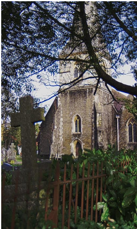
ST PAUL'S SKETTY