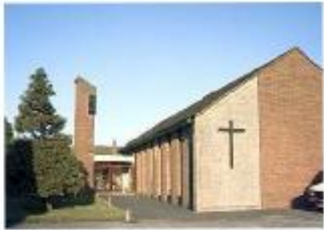
HOLY TRINITY SKETTY PARK