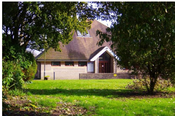
ST PAUL'S PARISH CENTRE