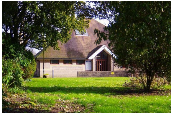
ST PAUL'S PARISH CENTRE