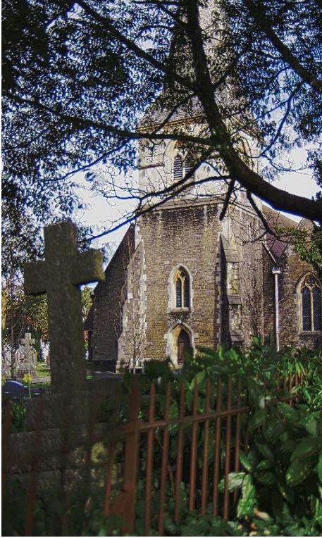
ST PAUL'S SKETTY