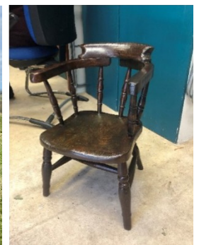
"Repair Shop" in Erith- The 100-year-old child's chair