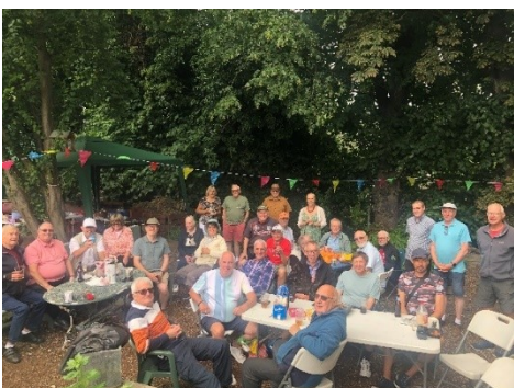
Men in Sheds Annual BBQ