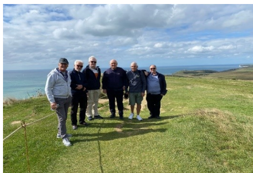
Shed Members in Beachy Head on their Eastbourne Adventure