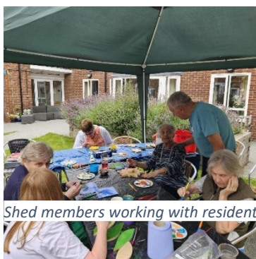
Shed members working with residents of Parkview Care Home

In November, the shed visited the day centre for adults living with learning disabilities to run a Christmas themed outreach session. Members and the day centre clients made wooden Christmas decorations and painted ornaments.