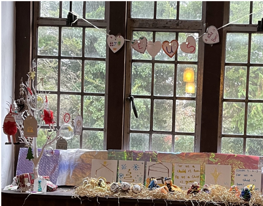
Youth created a Christmas window display for the church including a clay nativity scene using materials gifted to the Provision.