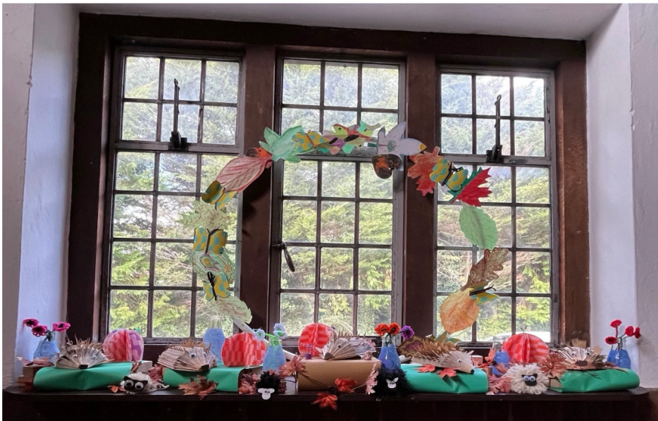
Youth recycled items to create a window display. Harvest festival window display 2024.