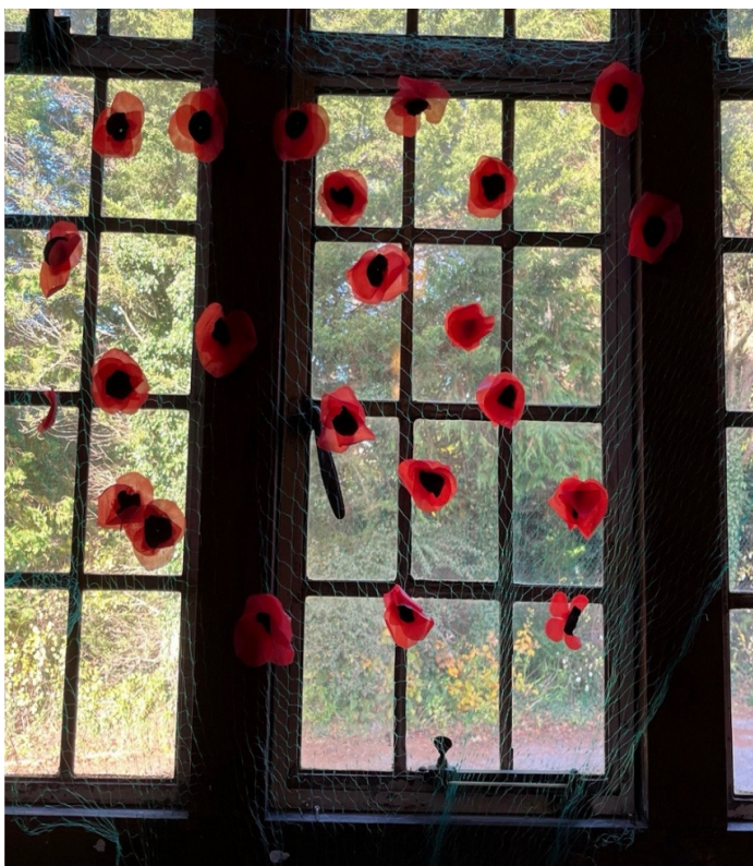
Youth created a Remembrance window display for the church which they plan to add to each year.