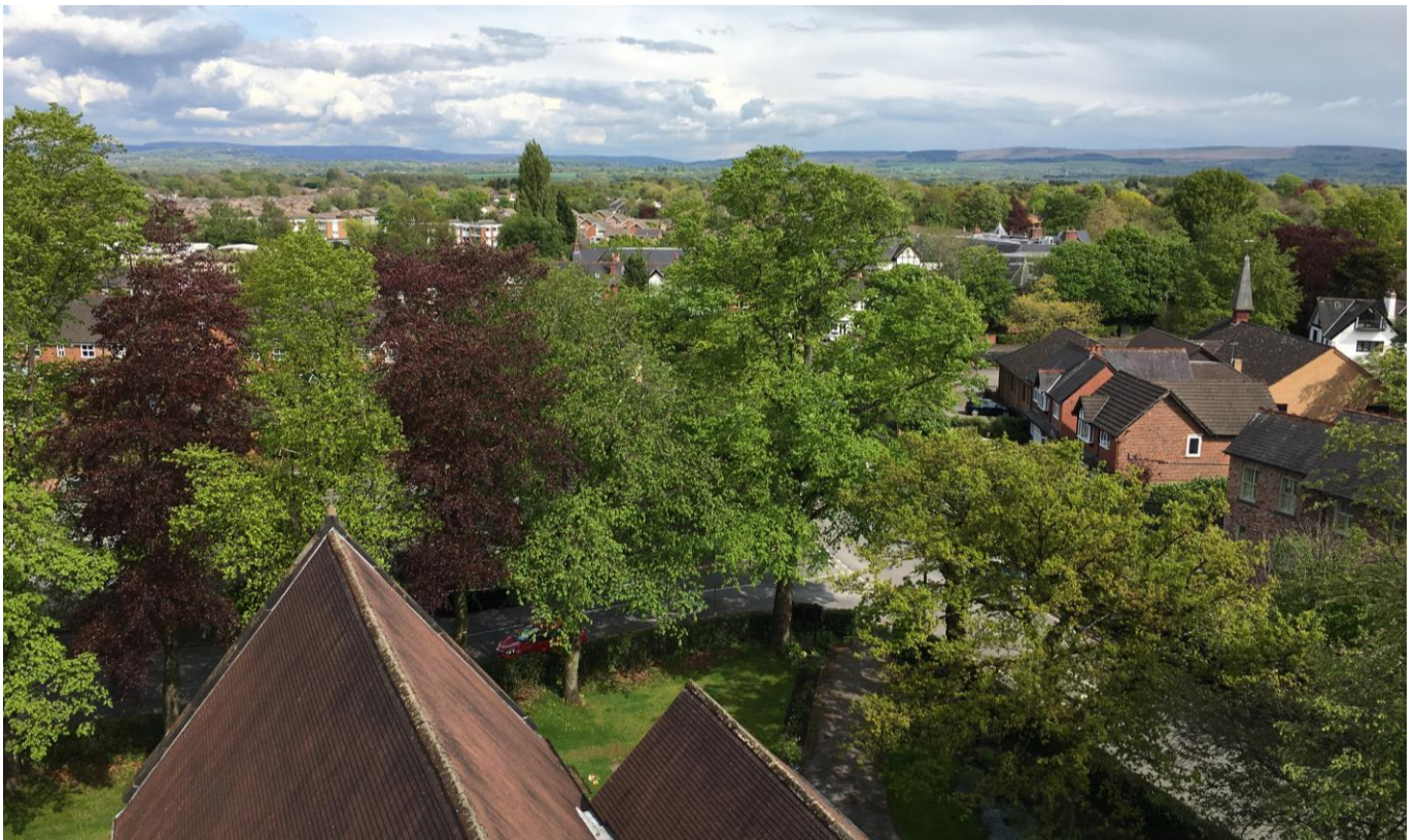
The view East from the top of the tower.