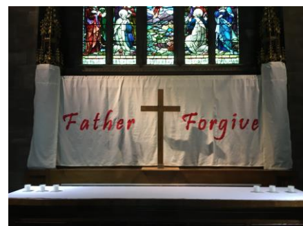
New Hanging for Passiontide