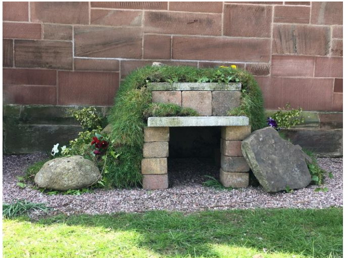
The Easter Tomb