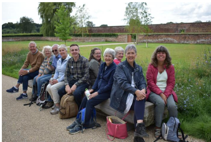
Gardeners Trip to RHS Bridgewater

Any building the size of St Michael's requires maintenance and attention, and considerable work has gone on in 2021. The Wardens report that during the year there have been two safety checks of the Fire Alarm system, along with an Energy Audit to see where savings might be made. As part of a five year electrical test requirement the old asbestos-lined fuse and distribution boards were replaced with a modern RCD trip switch distribution board. Steeplejacks were engaged to climb the roof of the tower in order to paint the louvred fascia of the bell housing, to repair the weather vane, and to repair the lightning strip, which had sheared. Over the year the Wardens carried out a thorough review and updating of the Terrier, a document which records all the fixtures and fittings of the church. After one boiler broke down the Parish Centre boilers have both been replaced and are now more easily controllable. The patio outside the Hall has been made level and safe. A survey shows that our numerous trees remain in good shape, but they still need regular attention. The uneven crazy paving in the memorial garden has been replaced by gravel and the drainage there has been improved.