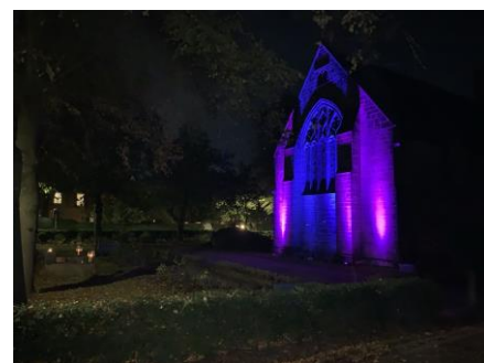
Baby Loss Awareness Wave of Light