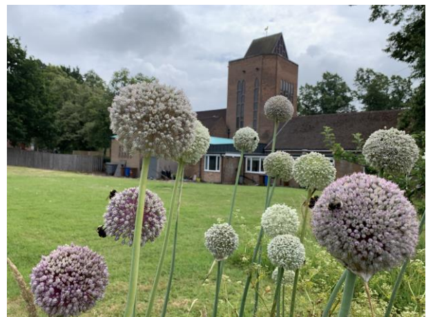
Flowers blooming around St Michaels