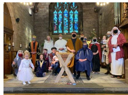
The Nativity Service

St Michael's continued to support the porridge project and the water tank project, and money was also sent to help rebuild the dispensary at Luatala. The money is being sent via a charity based in Germany that buys medicines for the dispensary to use