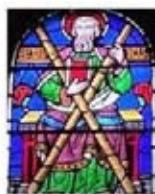
St Andrew's Church, Corbridge

It was a real delight to see how much enthusiasm the talks generated - it has been great to be able to offer these talks not just to the congregation at St Andrew's, but also to the wider community and even further afield - having guests join us from as far away as Germany and Spain! We hope to be able to build on all this in the future - when restrictions allow - by walking some of the more local parts of the routes together. With any luck, it will be a chance to translate all the virtual pilgrimages of Lent (just short of 200 miles in total!) into some communal pilgrimages later in 2021.