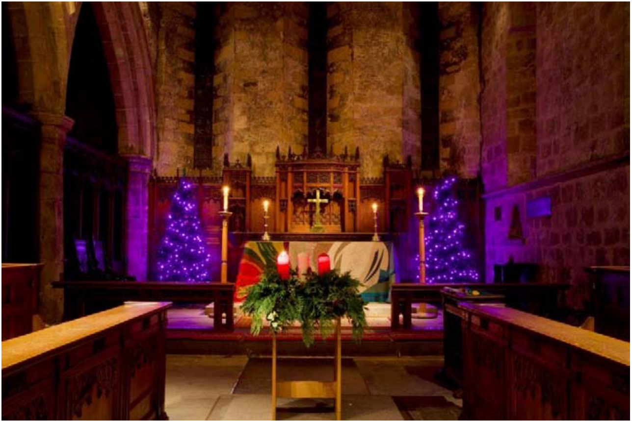
During Advent 2020