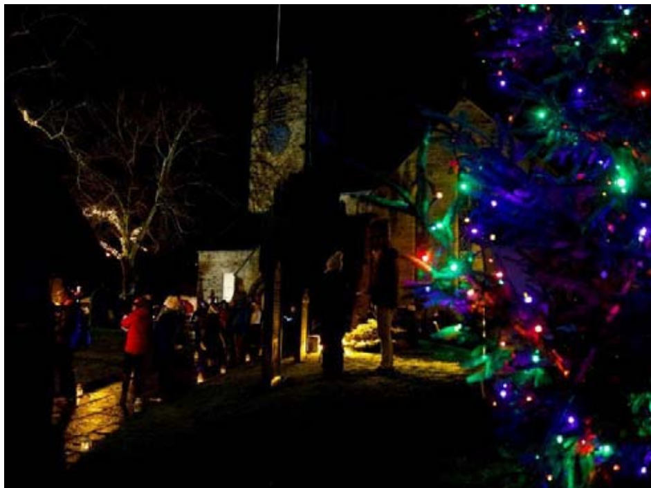
Carols for All in the churchyard.