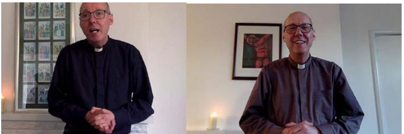
The first recordings from the vicarage – March 2020