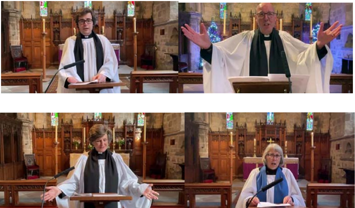
The Ministry Team recording their weekly Youtube service.

Therefore my beloved brothers and sisters, be steadfast, immovable, always abounding in the work of the Lord, since you know that in the Lord, your labour is not in vain.