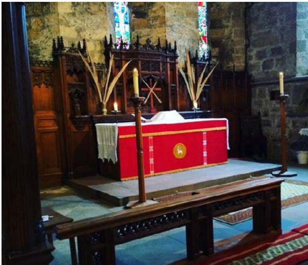
Palm Sunday 2021