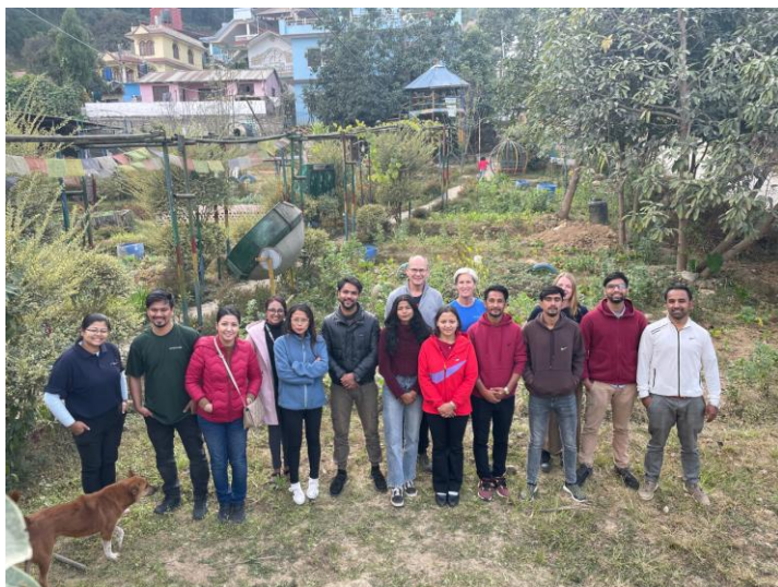
Trustee and student team-building day