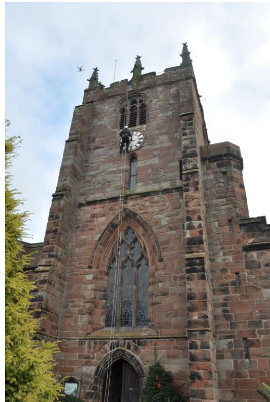
Repairs to the clock demanded some impressive work to remove the hands.

Repairs to the 1873 church turret clock were completed in November which involved removal of the external hands so the drive shaft could be withdrawn. We are grateful for the fundraising organised by the bellringers which avoided any call on