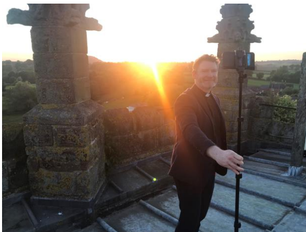
Bunbury Church Online filmed on the church tower at Ascensiontide.