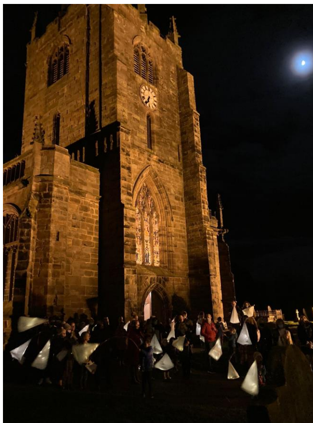
Due to Covid restrictions, a service of light with lanterns replaced the usual Christingle service

picked up packs with all the materials needed and walked proudly to Church with their lanterns. The service itself was very moving.