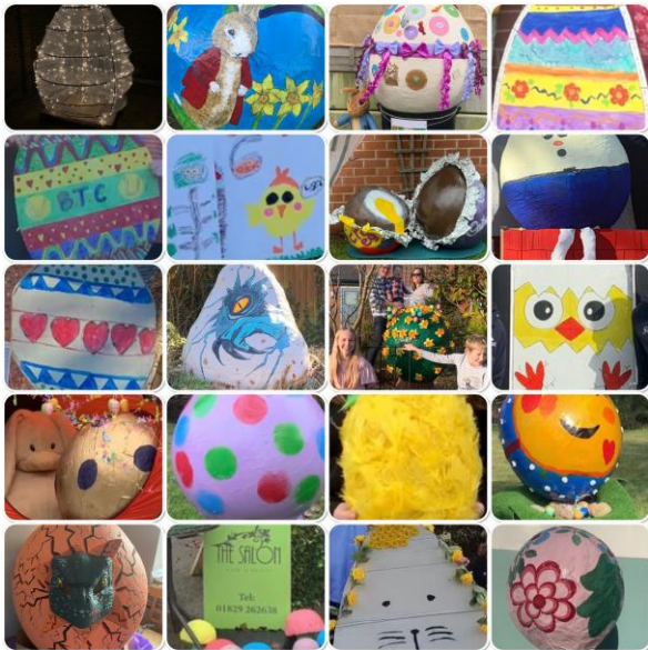
40 households took part in an Easter egg trail around the village during Lent and provided some wonderful creations.

2021 was another year shaped by Covid, starting with further restrictions in the winter months. In solidarity with our NHS workers, we suspended Sunday services between January and March when the peak of hospitalisations and deaths was placing strain on local hospitals. We did however continue to offer online services every Sunday (throughout the entire period of the report) which were well supported by a growing list of lay contributors, and continued to be viewed by many who were unable or would not necessarily wish to attend a service in person.