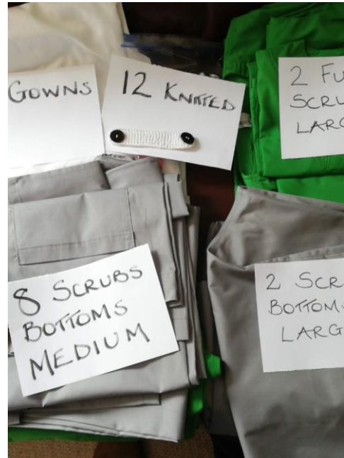
Community projects included a group of "sewing bees" who produced PPE for NHS and care workers.