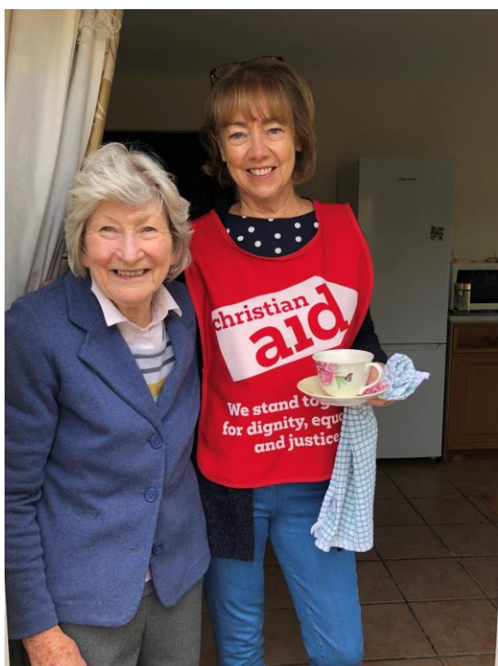
The church has a strong tradition of supporting other charities, particularly Christian Aid with fund-raising events.

Unrestricted funds. Total income and endowments on ordinary unrestricted funds were £89k which was the same as the 2020 (and up on 2019 by £5k). However, a significant element of this increase was associated with fees arising from weddings (bellringers, organists etc) that had been largely absent in 2020 (and for which there are matching costs); the underlying level of giving was more stable, and absent the particularly generous one-off donations that had occurred in 2020 in response to the financial challenges of the pandemic. The position is therefore broadly stable, but there is still an underlying need to address levels of giving in the medium to long term.