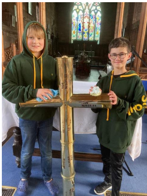
The memorial cross took pride of place at the Remembrance Service.

general church funds. A welcome quiz night was held in the church between Covid restrictions.