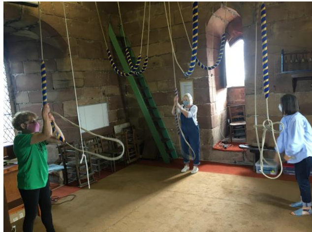
Whilst remaining Covid-compliant our bellringers were still able on occasions to ring the bells at services in 2020.